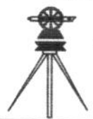
EXHIBIT "B" 15.00' WIDE PUBLIC UTILITY EASEMENT

Denson Surveying a professional corporation SURVEYING & MAPPING Yerington, Nevada (775) 463-3611