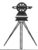
EXHIBIT "B" 10.00' WIDE SOUTHWEST GAS EASEMENT

Denson Surveying a professional corporation SURVEYING & MAPPING Yerington, Nevada (775) 463-3611